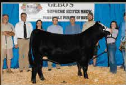
SUPREME CHAMPION FEMALE , 2017 GEBOS Shown by the Bird Family