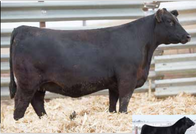
DEW NORTH His service sire sells.