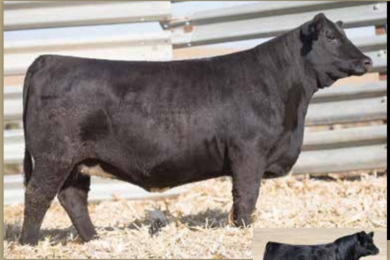
W/C EXECUTIVE ORDER 187D His service sire sells.