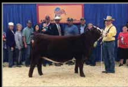
CHAMPION %SIMMENTAL HEIFER , 2018 NE State Fair Shown by the Borg Family