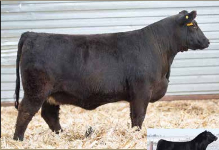
DEW NORTH His service sire sells.