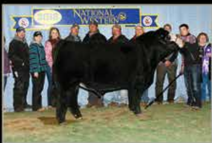
LATE SUMMER CHAMPION , 2018 NWSS Simmental Show Shown by the Double J Farms