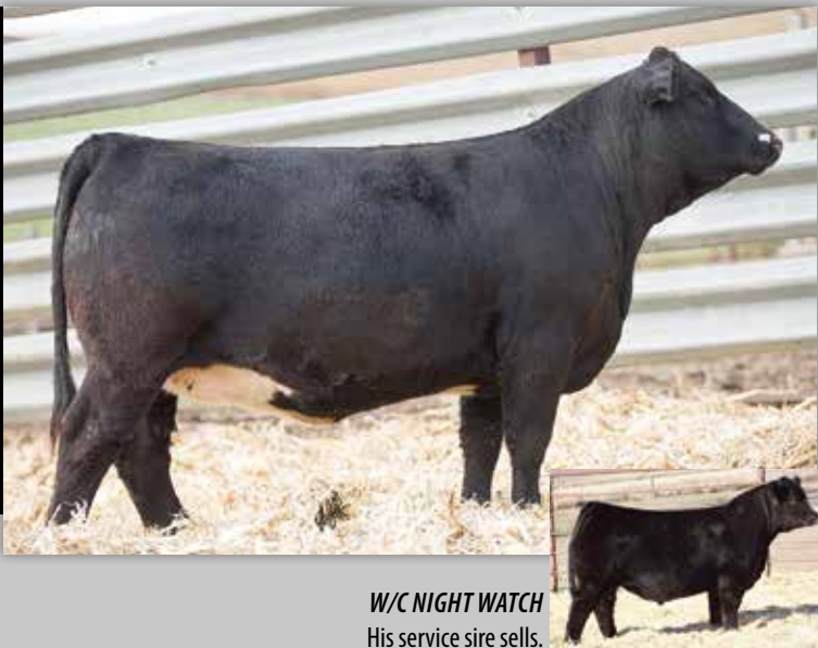
W/C NIGHT WATCH His service sire sells.