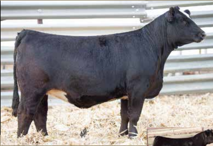
W/C NIGHT WATCH His service sire sells.