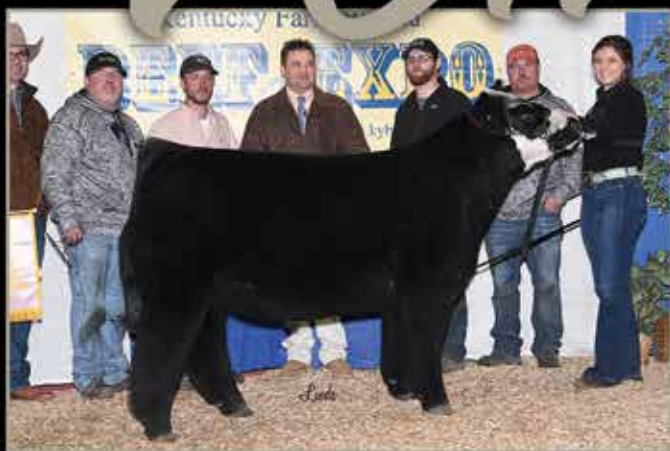
4TH OVERALL CHAMPION STEER , 2017 KY Beef Expo Shown by the Walker Family